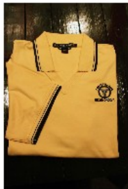
LADIES 'BUTTER' POLO $40 NOW $15