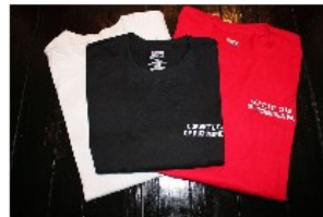
T-SHIRT (Short Sleeve) $16 NOW $12