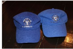
"ROYAL BLUE" BASEBALL CAP $15 Now $7.50