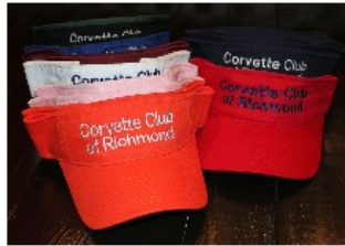
VISORS $12 Now $6