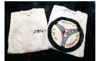
T-SHIRTS (Long Sleeve) $20 NOW $10

"Corvette Club of Richmond" WINDOW CLING $15