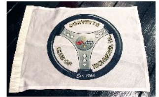
FLAG (white, 13"x9") $13 NOW $5