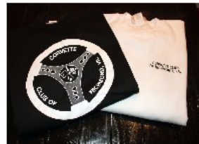
SWEATSHIRTS (black, white, red) $25 NOW $12.50