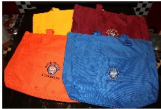
TOTE BAG $20 Now $10

Clearance pricing on in stock items only, while supplies last!